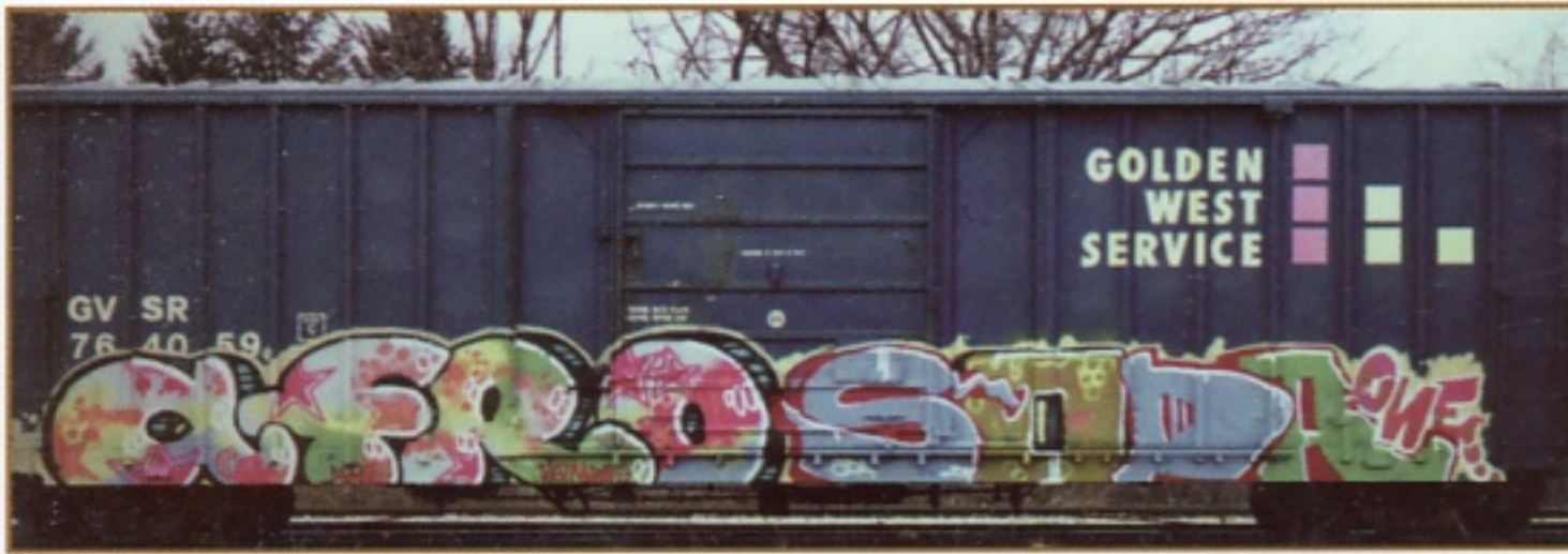
AFRO & SODA PASSIN' THRU INDIANA