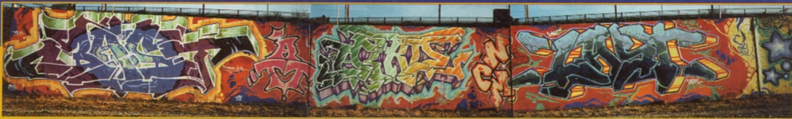
EAST AERO & LAST ATT - NCM CREWS