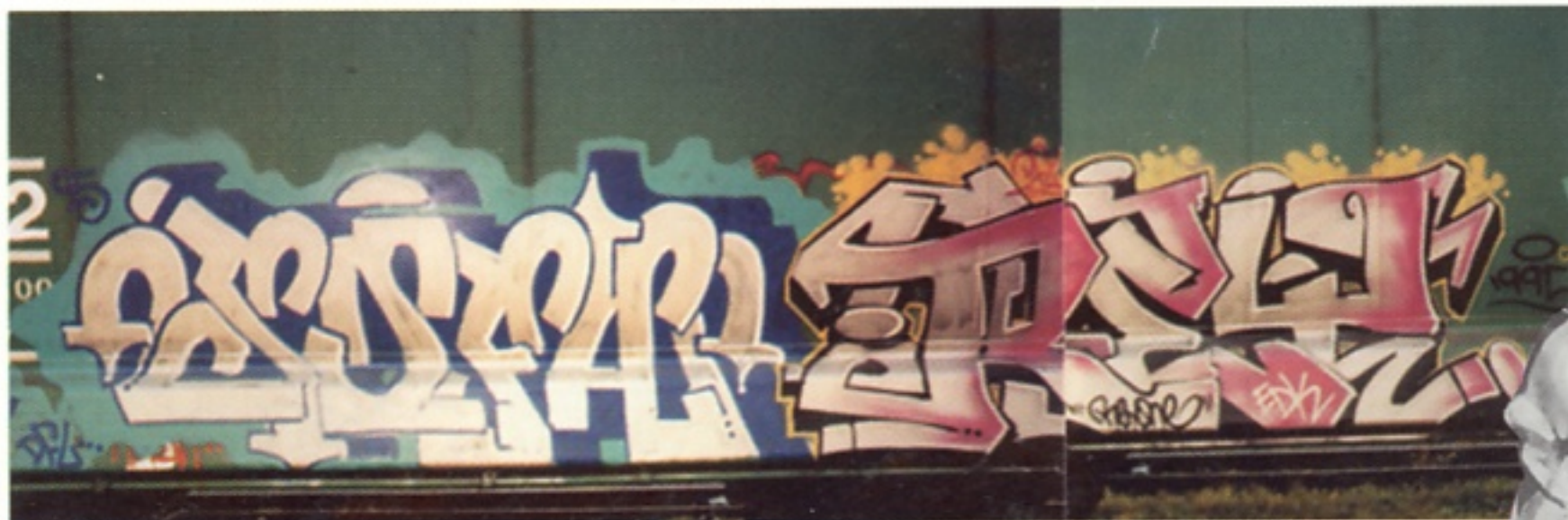
SOFA & REYS.SEATTLE