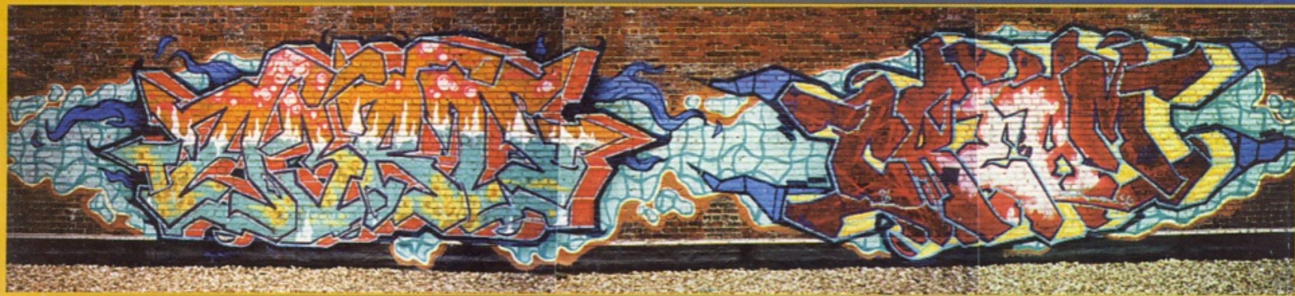
AERO & CREAM. NCM CREW