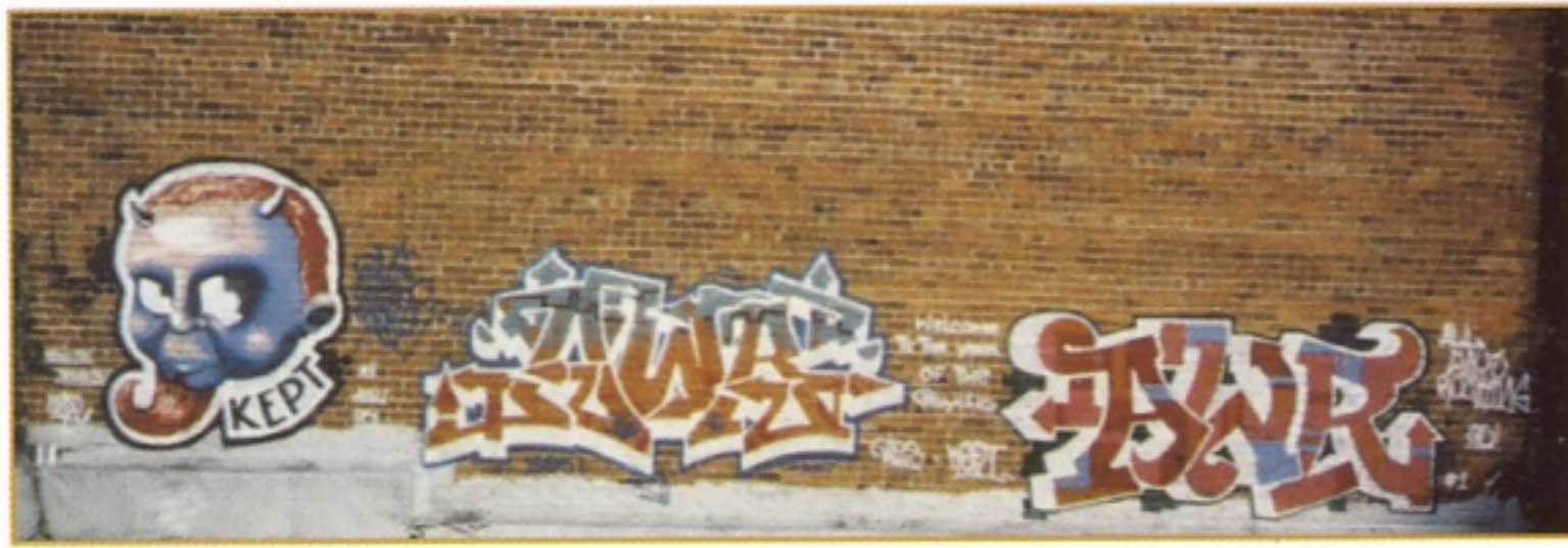
BLES & KEPT.AWR