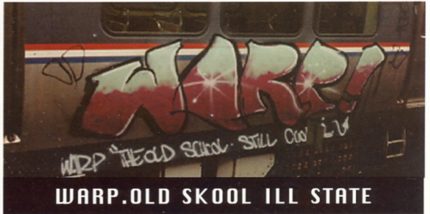
WARP.OLD SKOOL ILL STATE