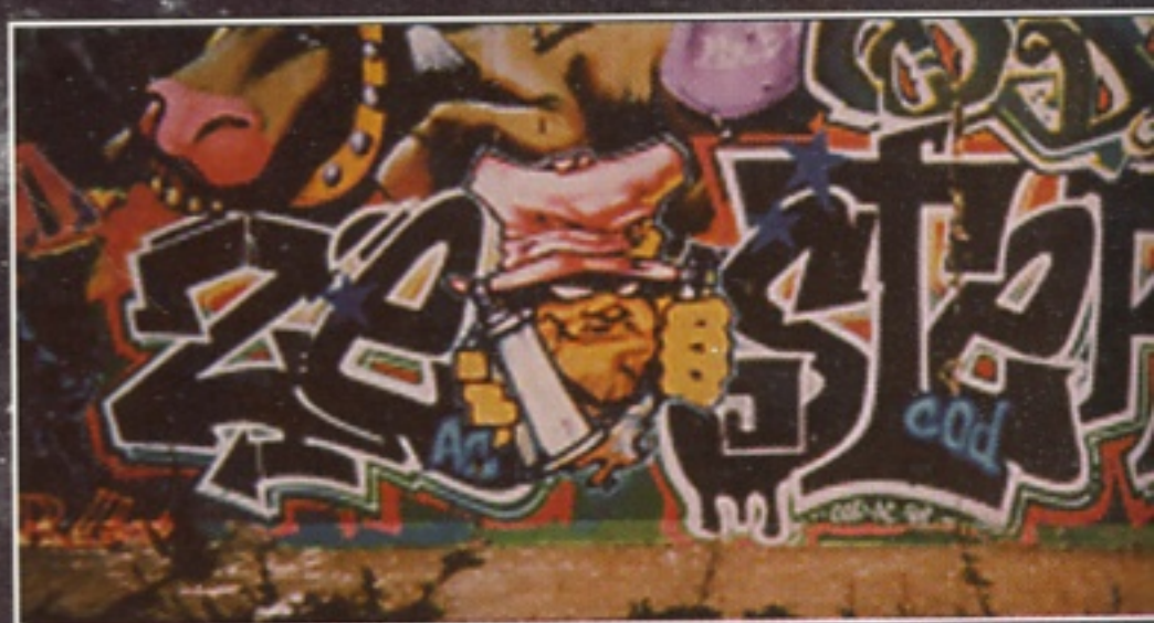
ZEBSTER & MODE 2