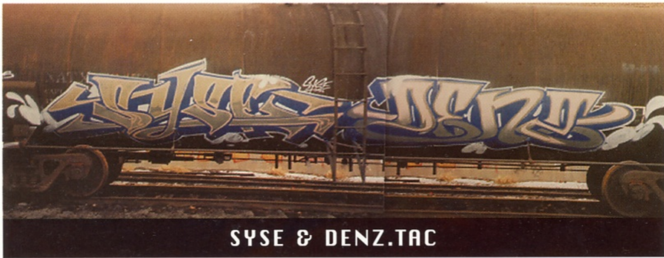
SYSE & DENZ.TAC