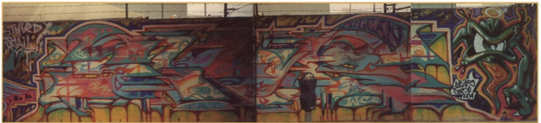
THE GREAT VULCAN