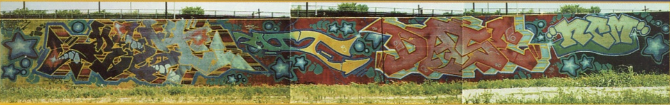
EAST & DASE