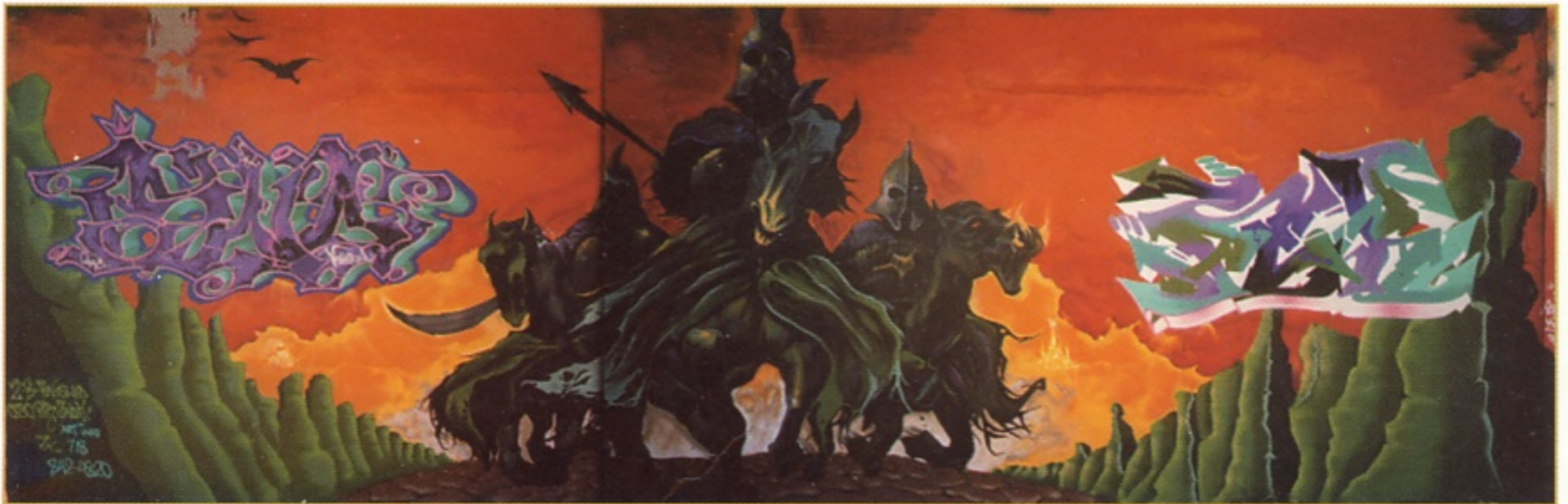
SNOW CES & PER. FX