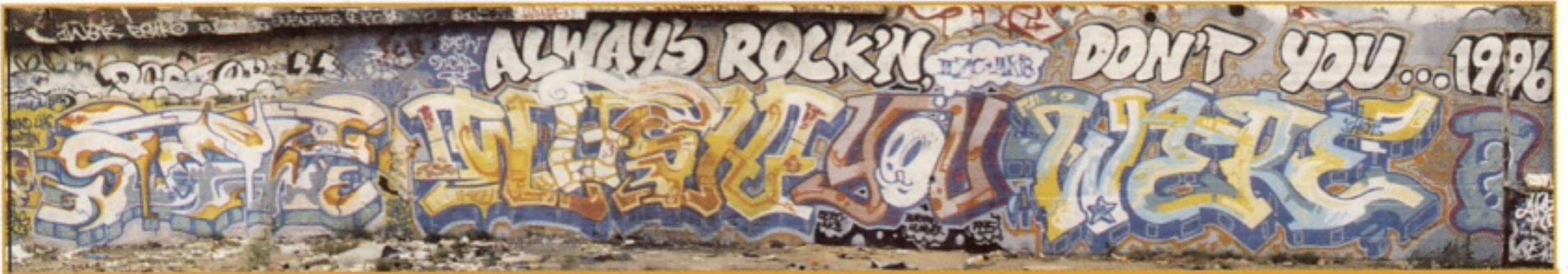
2ZC & AKB CREWS