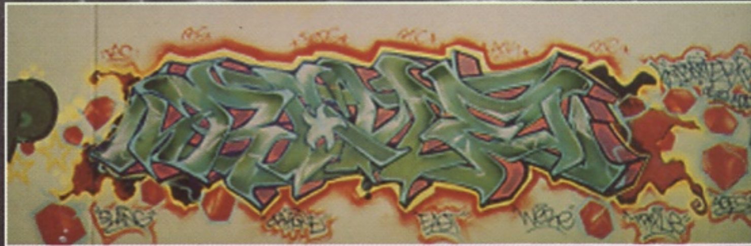
RONE.TAC. IN NY