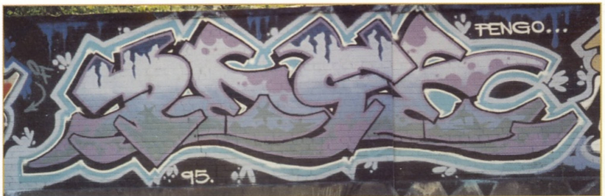
PEGE BY PENGO.CHICAGO